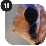
OCTOMITUS / HEXAMITA / SPIRONUCLEUS