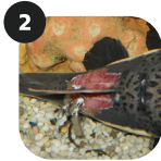
TRAUMA / WOUNDS