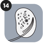
ICHTHYOBODO NECATOR (COSTIA)