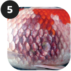
PSEUDOMONAS / AEROMONAS